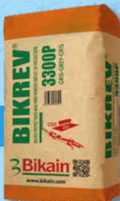
BIKREV 3300 P CSIII-WO

Rendering of concrete walls (grey/white), patios, garages or dividing walls both indoors and outdoors. .With the addition of fibers (outdoor). Excellent workability due to their thixotropy. Good adherence to most of conventional supports.