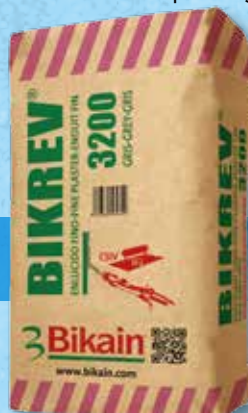
BIKREV 3200 CSIV-W2 Waterproofing