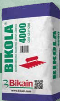
BIKOLA 4000/4001 ZA