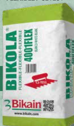
BIKOLA 4000/4001 FLEXIBLE / C2TES1