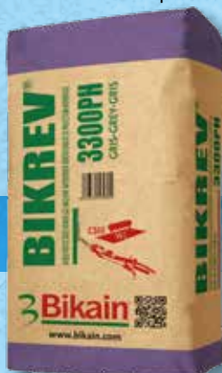
BIKREV 3300PH CSIII-W1 Waterproofing