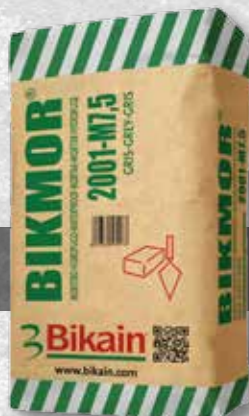
Grey / white color